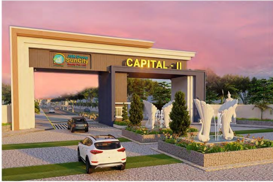
24/7 Security with Maintenance