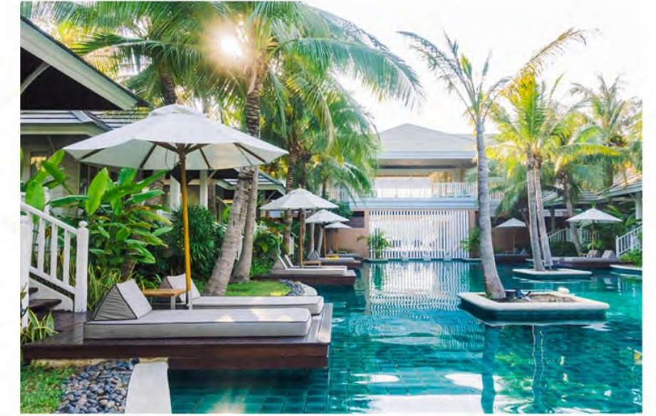
Proposed Green Resort