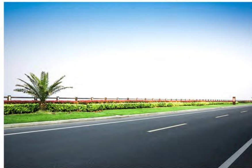
Formation of 60', 40' & 33' feet Black top wide Roads.