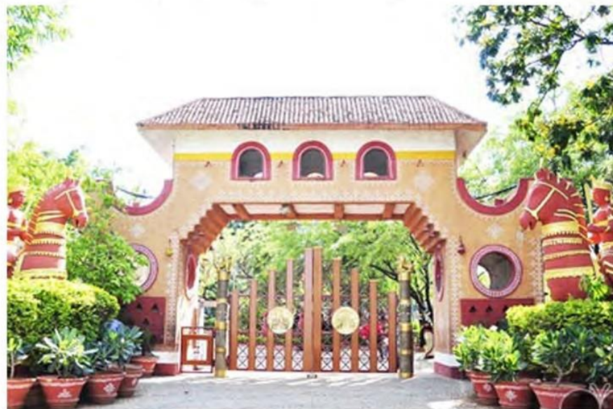
Proposed Mini Shilparamam