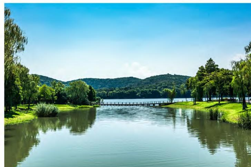
Scenic Man-made Lake