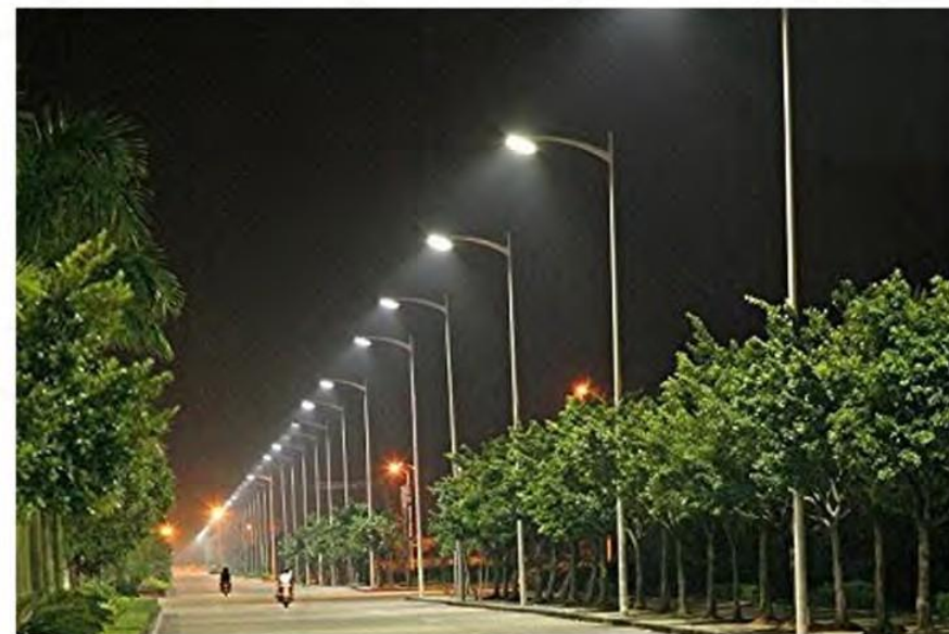
24/7 Power Supply