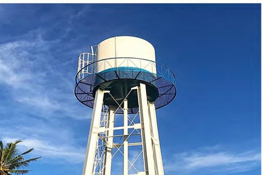
Overhead Water Tank