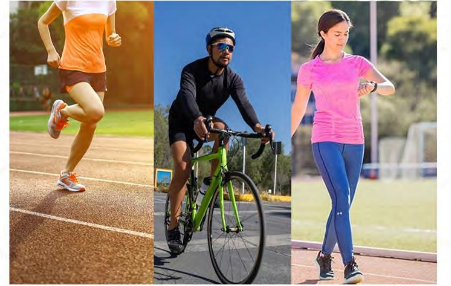
Walking, Jogging and Cycling Tracks